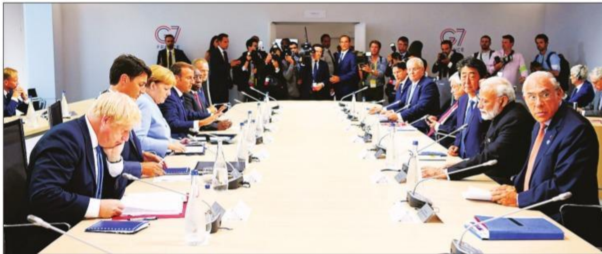
Prime Minister Narendra Modi with (from left) British Prime Minister Boris Johnson, Canadian Prime Minister Justin Trudeau, German Chancellor Angela Merkel, French President Emmanuel Macron, South African President Cyril Ramaphosa, European Council President Donald Tusk, Italian Prime Minister Giuseppe Conte and Japanese Prime Minister Shinzo Abe at a working lunch with world leaders during the G7 summit in Biarritz, France.