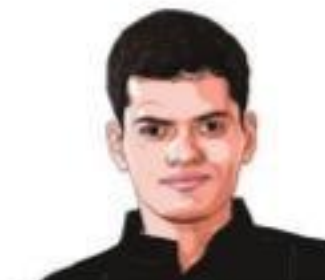
EXPRESS AT G-7