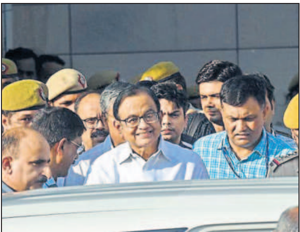
■ Senior Congress leader and former finance minister P Chidambaram comes out of Delhi's Rouse Avenue Court after a hearing in New Delhi on Monday.